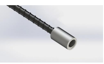
2. Screw the coupler on the threaded bar.