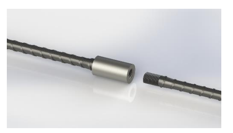
3. Align the corresponding rebar. Rotate the rebar to the middle of coupler.